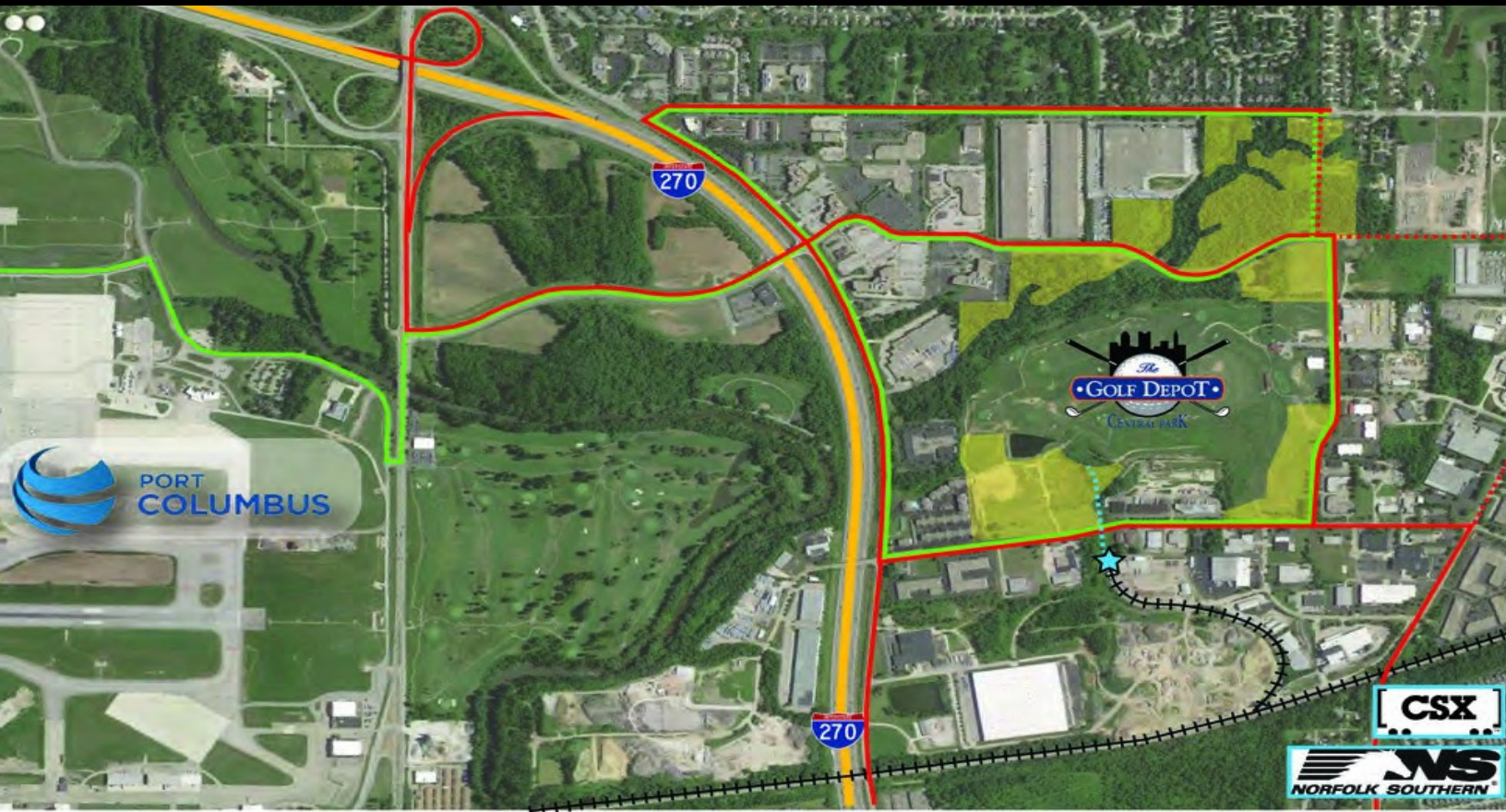
★ Rail Loading Access Route to Interstate Access Route to International Airport