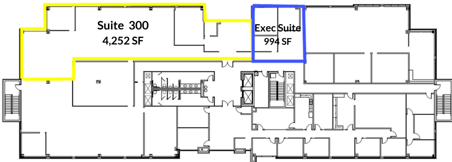
third floor plan